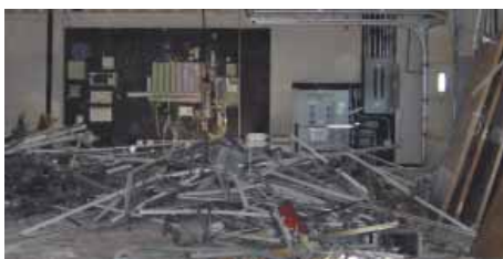
Future home of the Book Order and Processing Departments in the new library.

Library processors are also responsible for deleting lost and damaged books from the catalog, repairing or replacing damaged covers/cases, replacing labels, and editing records in the online catalog. The Processing Department processes 9,000-10,000 items per year.