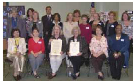
Library directors or representatives from all 20 libraries were in attendance.

Each member library had a display showcasing their library's history and services. A presentation explained the history of LOGIN from its start as GOLD, to the present, as the first library consortium in the state to include academic, school, municipal, and county libraries.