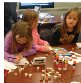
Photos from Makers Day 2018.