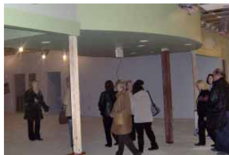
Library staff get their first look at the new library.

One lucky family of four will win a “Behind the Scenes Tour” of the new library before it opens to the public!