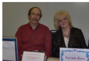
The Sixth Annual Meet the Authors was held on April 20. For more photos, please visit www.meettheauthors.net .