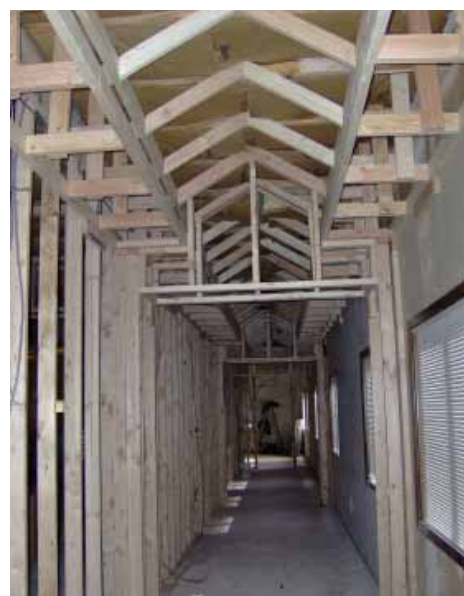
Above, hallway and gallery area. Below, outer walls of the Children's Area.