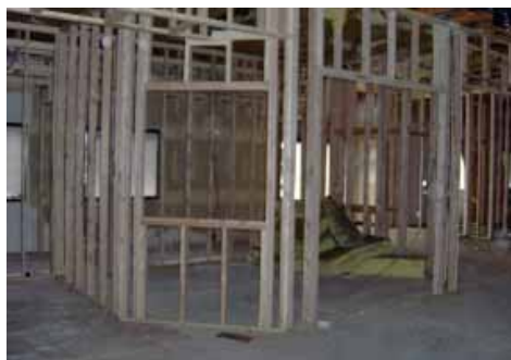
Above, Friends of the Library Book Sale area. Below, fun shaped windows in the storyroom.

Construction at the new library is progressing rapidly. All of the walls have been framed and the electrical is in. Work is continuing on the sprinkler and HVAC systems. Cables for computers, phones, and the security system will be completed soon.