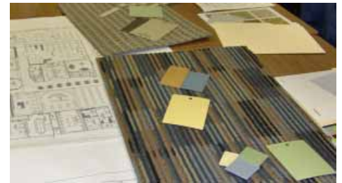
Shown above are carpet and color samples for the new library.

the plumbing is in place. The next phase is installation of the sprinkler system and then framing the new walls.