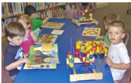
Toddlers enjoy some books and puzzles in the library after attending a Toddler Time program.